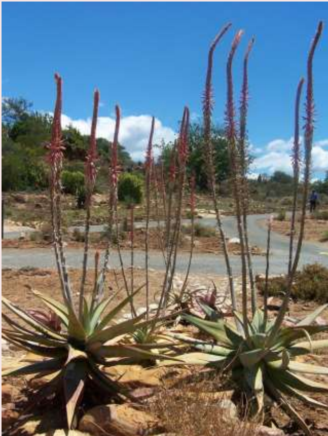
'Preview of the future MBG'