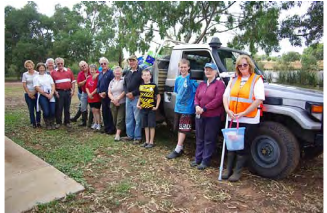
The clean up volunteers

Fifteen volunteers turned out for our first 2010 Clean Up Day. There was plenty of rubbish as the last clean up we did was in October 2009. Things are now looking tidier in the Garden thanks to the efforts of these volunteers.