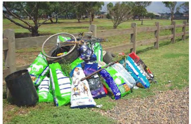
The pile of rubbish including one old bike

Attila Kaptiany's Open Garden April 10-12