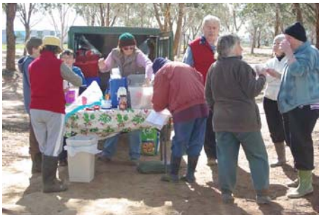
FoMBG volunteers enjoying a well earned break at the end of the planting day.

Their next task will be to slash and poison this woody weed.