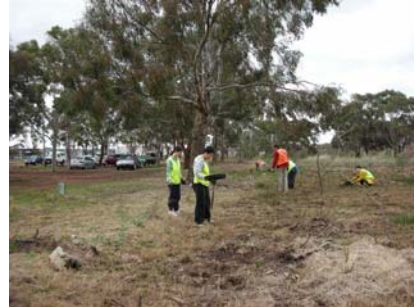
Conservation Volunteers helping at a special GTG Day

The Grow the Garden Days have been a great success so far this year. Since May we have planted 10,609 plants with 2,200 on hand to plant on Thursday 8th October. Well done everyone. Just a few more planting days left this year. Then we will be into weeding and watering. Take a walk along Ryans Creek and see the progress.