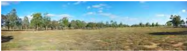
Eucalyptus Arboretum area