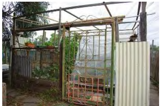
Someone's garden patch at CERES

We had a stroll through the garden area which reminded us of the vegetable gardens and chook sheds and memories of the old fashioned Australian backyard. There was nothing new about the advantages and sustainability of composting.