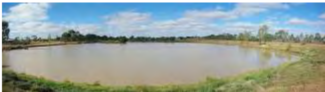
The Melton Botanic Garden lake

The Australian plant sections covering the Eucalyptus Arboretum, Western Australian, South Australian, Australian Dryland Garden and Indigenous People's Garden were presented. Finally the progress of the revegetation along project along Ryans Creek showed the on ground work of the Friends in helping to establish the Melton Botanic Garden.