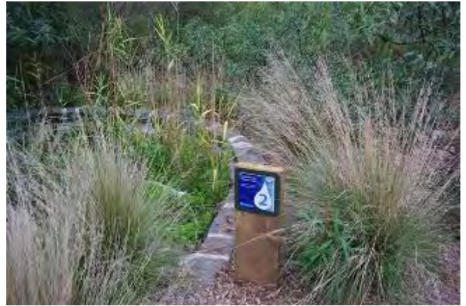
Grassland and bog display garden

They run a bicycle repair shop for people to bring in old bikes to rebuild. The organic market sold small and very expensive produce much of which was not very attractive to look at. People had stalls to promote their environment friendly groups.