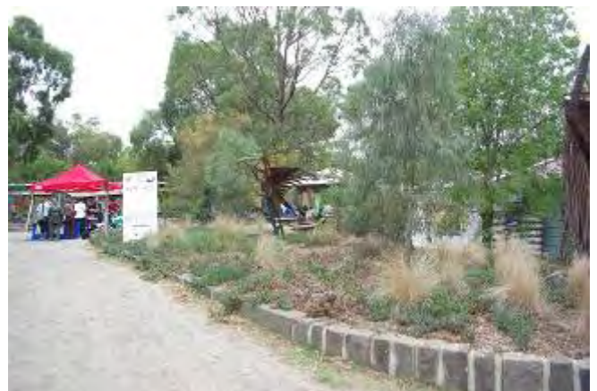
One of the many environmental promotional stalls

Lunch and a relaxing drink and chat back at Hannah Watts Park in Melton completed the day.