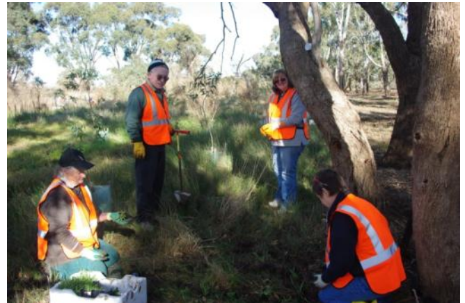
Some of the crew working away