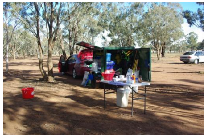
Everyone's gone planting

Why not join us on the next Grow the Garden Days – 2 nd Thursday and 4 th Sunday every month. We can assure you the Grow the Day is very therapeutic, great exercise and extremely enjoyable.