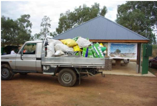
Loads full from both sides