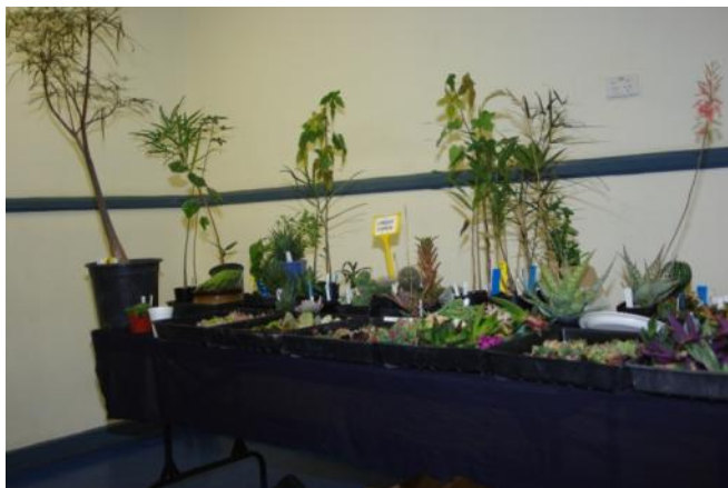
Some of Attila's range of succulents