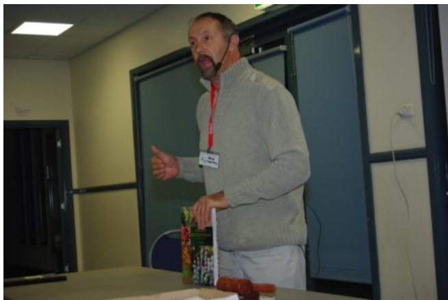
Attila in action

Great reports have been received from some of those attending the meeting. Attila certainly had people laughing, listening and he showed some spectacular photos of unusual West Australian plants. Now don't forget when you are on your next trip out don't stop at the rest stop, or where the buses stop or where people stop for other things, keep on driving, pull up at least 5 kms down the road from the bus stop and take a look around. Also if you get a flat tyre take the opportunity to have a look around and get some photos of the plants.