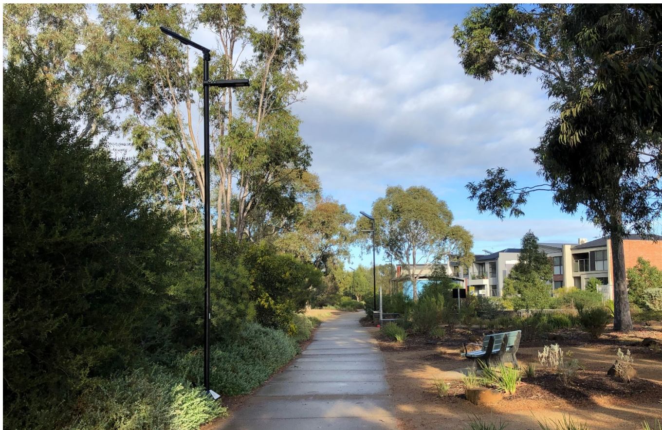
Lights at the Bushfoods Garden

Fifteen solar street lights were installed in the garden in late July. The funding came through a State Government Regional Botanic Gardens grant, which was applied for by Melton City Council. Lights dim but brighten when a person approaches them (but only at night of course).