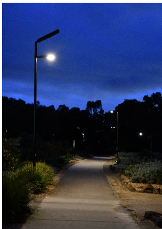
A light near the Mediterranean and Southern African Garden – it works