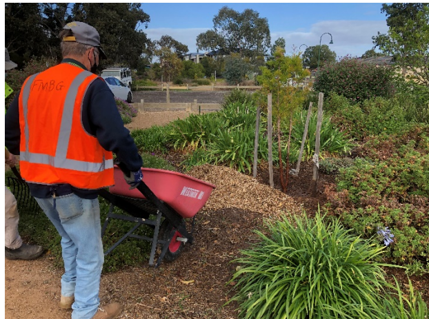
Ian bringing the mulch