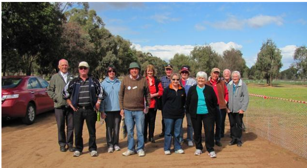
Some of the walk participants

The first organised guided tour of the Eucalyptus Arboretum was held in September. The walk was organised for the Melon Garden Club. The CVGT Work Experience Activity Team also joined in the walk as did some FMBG members.