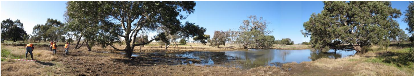
Photo: Melton Botanic Garden – National Tree Day 31 st July 2011