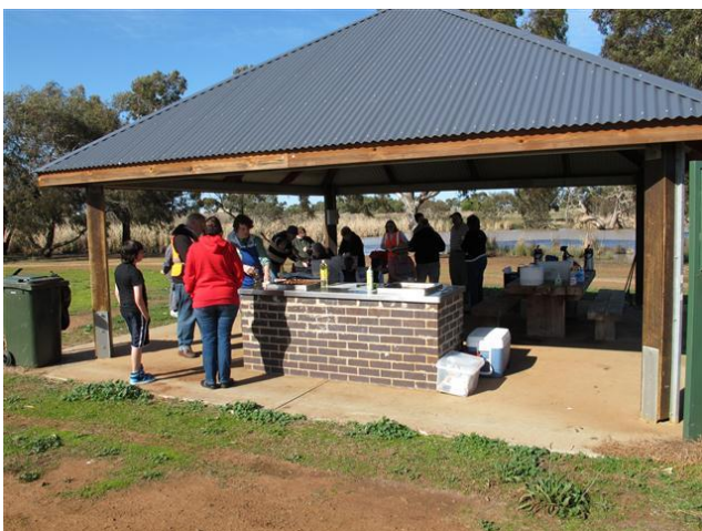
Participants enjoying the BBQ