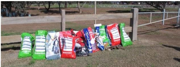
Reporters: Elaine and Les.