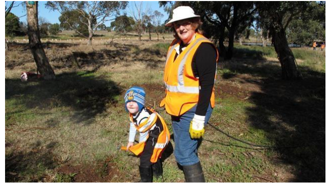
Willing helpers growing the garden

Grow the Garden Days continue a pace to get plantings in before the hot weather comes.