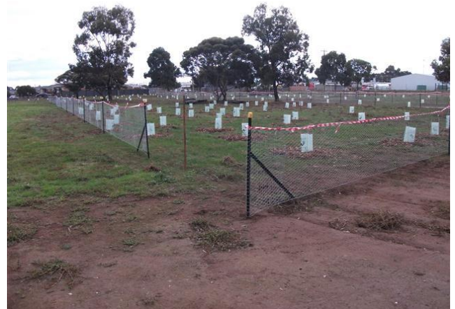
Fencing constructed by the CVGT work experience activity team

The garden will also attract visitors from across the region. Enquiries should be forwarded to: friends@fmbg.org.au