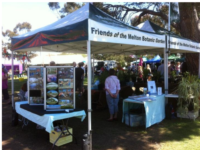
FMBG marquee Djerriwarrh Festival

We had many enquires, received two new memberships applications and sold many plants. Over $225 was raised in funds for FMBG.