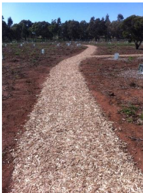
A secondary path towards Ryans Creek

In November the team commenced the secondary path toppings with recycled wood mulch. This type of mulch is slow to breakdown.