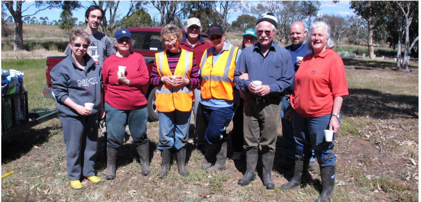
Photo: Melton Botanic Garden – Volunteers at Grow the Garden Day 25 th September 2011