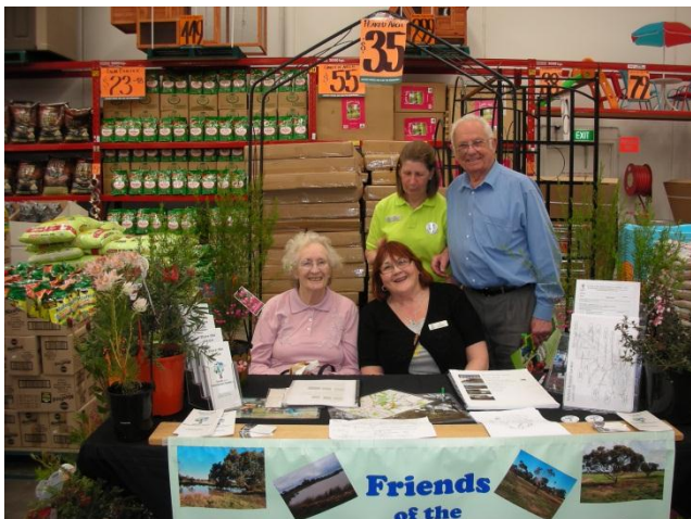
Some of the crew at the Spring Launch FMBG table

FMBG were out again promoting the Melton Botanic garden in October at the Bunnings Melton Spring Launch. Thanks to all those who helped at the FMBG table.