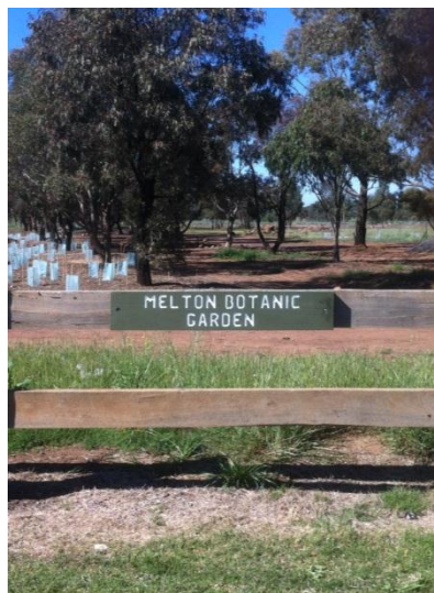
Sign on fence

You will now be able to confirm you are at the Melton Botanic Garden if you are travelling along Tullidge Street as the Melton Botanic Garden name is on the fence.