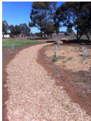
A secondary path towards Lakewood

FMBG members continue to help support the team by bringing morning team for them.