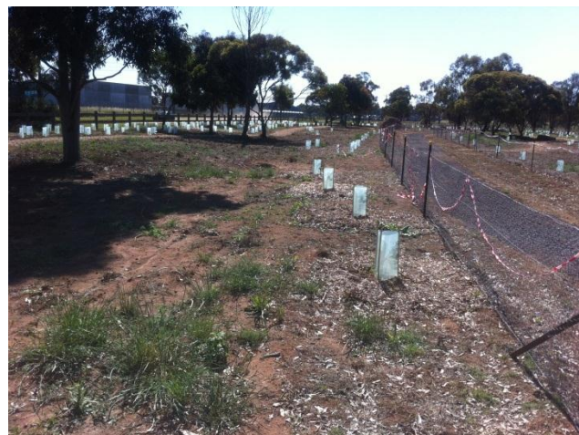
Eucalypts are growing all looking good including the weeds

The Working Party meets on 10 November to plan the work for the next few months and early 2012.