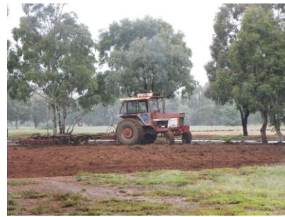
Tractor scarifying the Eucalyptus Arboretum