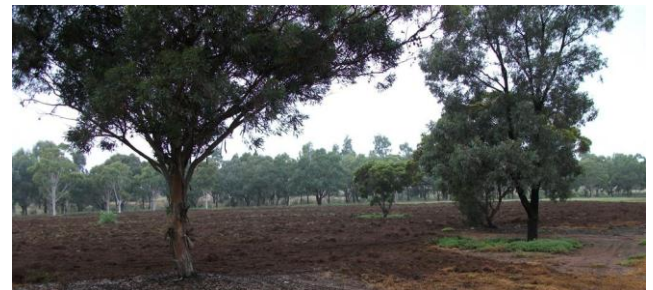
Completed ripping on east side of the Eucalyptus Arboretum

We are awaiting the establishment of the work for the dole team and the appointment of a team leader.