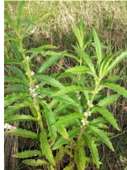
Lycopodium australe Australian gypsywort

These photographs were taken at Ryans Creek of some of plants in flower right now.