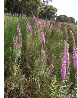
Lythrum salicaria Purple loosestrife

The purple loosestrife looks stunning at the moment. There are a number of stands along the creek. Lycopodium australe has small white flowers from January to March. It will die back in June for winter. It is a semi aquatic herb which grows to 1 to 1.5 m high with clumps of stems developed from an underground rhizome.