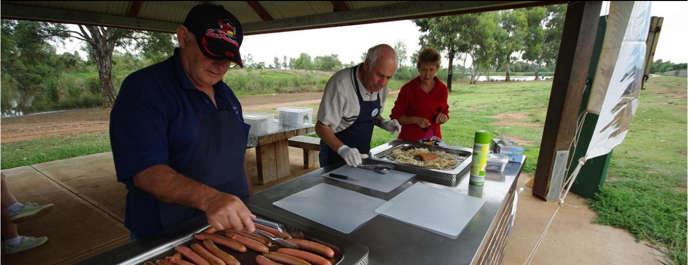
Photo: FMBG February Meeting at the Melton Botanic Garden