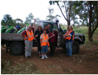
Some FMBG members after weeding on 10 th February

Next Grow the Garden Days are in March on Thursday 10 th and Sunday 27 th 10am-12noon.