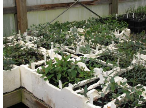
Eucalypts in the hothouse

The eucalypt seedlings are still growing, and even more so since the Pyes moved them into the hot house.