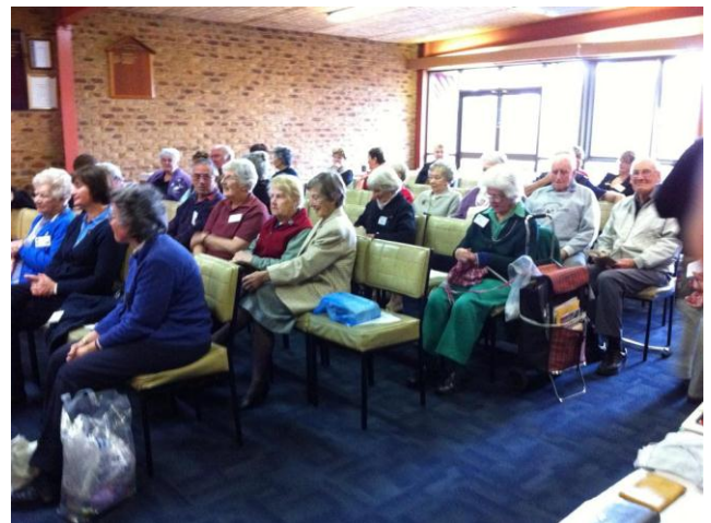
Footscray Garden Club Members