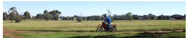
Trail Bike Policeman patrolling the Melton Botanic Garden

Thanks to Melton Shire Council and everyone who contributed to getting the restrictions in place as it is most heartening to see this support so that the probability of damage is lessened to the planting work FMBG have been doing.