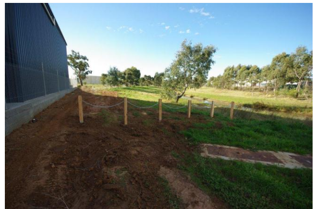
Restricted access along Ryans Creek from High Street

When the car park is constructed near the BBQs it would be hoped a similar type fence could be used to restrict the vehicle flow from near the lake into the Melton Botanic Garden.