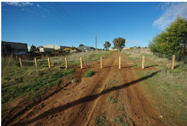
Restricted access from the industrial estate

Good news. MSC have moved quickly to restrict access near the industrial estate by placing a post and chain fence across the dirt tracks following our lodgement of issues.