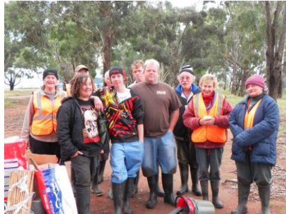
FMBG and CaLM workers

On 2 nd June, hardy volunteers with help from CaLM volunteers, staked, cleared areas, weeded, dug holes and planted more industrial area screening trees along Ryans Creek as we did a couple of weeks ago. Apparently we will be doing this most Thursdays mornings for quite a while.