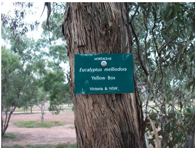
Some of 100 tree labels