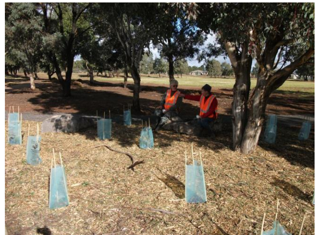
FMBG members enjoying a break on the ACRP rocks

It is looking good along the paths and you can sit on the rocks from the Anthonys Cutting Realignment Project (ACRP). By the way the ACRP is going to place a plaque on the rocks to indicate their contribution to arboretum.