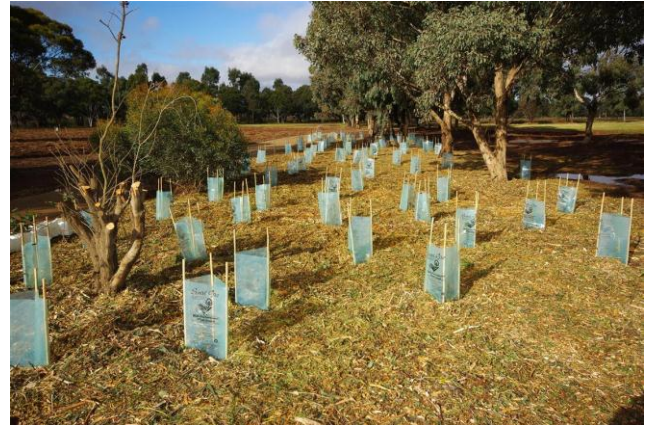
CVGT team plantings along the main MBG path

The council are now regularly dropping off mulch for us to use. The CVGT Team have been using the mulch to spread around their plantings under the trees along the main MBG path.