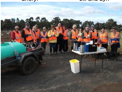
Last Day Crew