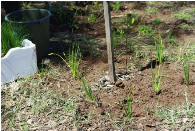
Some of the plantings

Next Grow the Garden Days are in February on Thursday 10 th and Sunday 27 th .