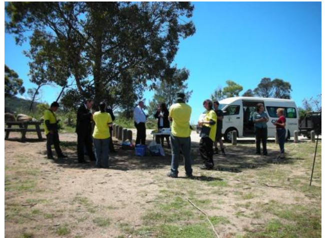
Some participants at the NGJC graduation