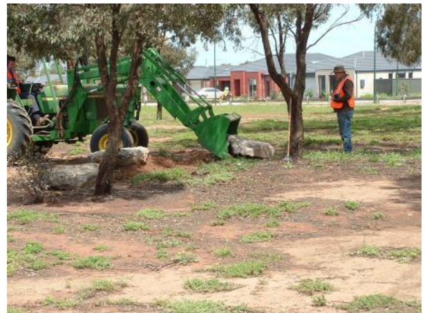
Positioning the rocks into place