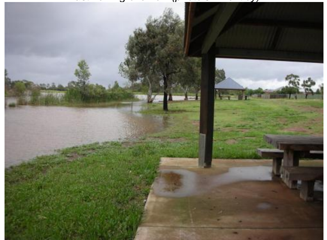
Lake nearly to rotunda