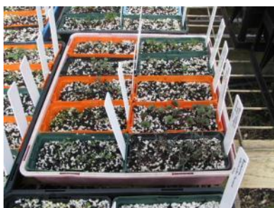
More baby eucalypts – this is exciting