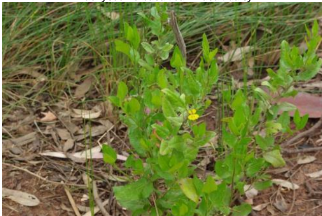
Goodenia ovate – Hop Goodenia