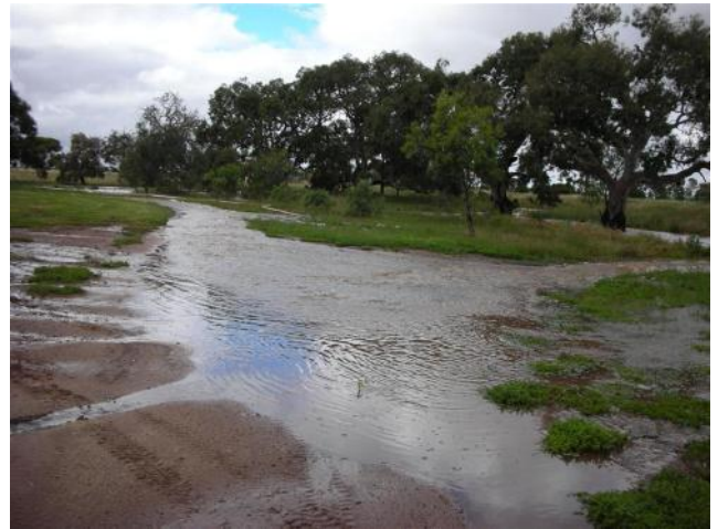
Ryans Creek on right, overflow on left