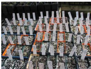
Baby eucalypts