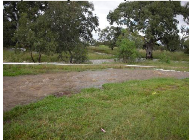
Fast flowing overflow