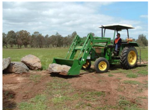
Moving rocks