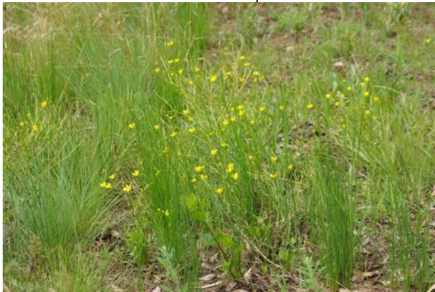
Ranunculus lappaceus - Australian buttercup