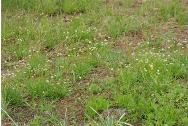
Brachyscome basaltica - Basalt daisy

Some of our 2010 plantings are in flower.