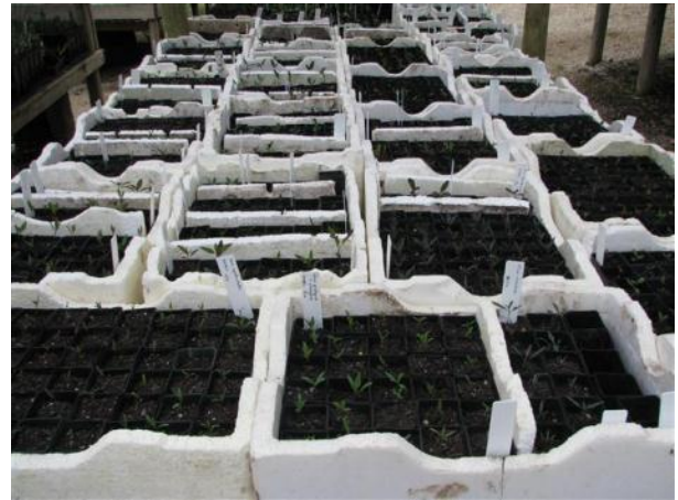
Potted up eucalypts

If you know anyone who is willing to contribute please contact David Pye or John Bentley. The project requires site preparation involving activities such as marking out, ripping, building pathways plus getting associated materials and equipment.