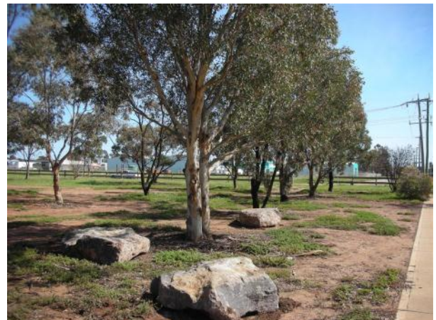
Some rocks in final position near the path