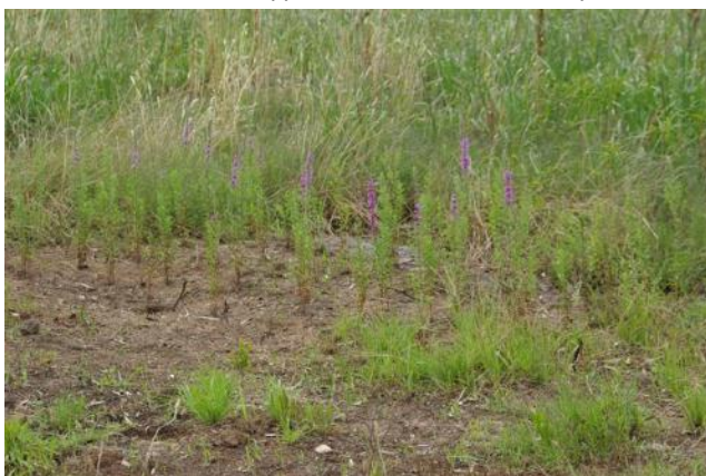
Lythrum salicaria - Purple loosestrife