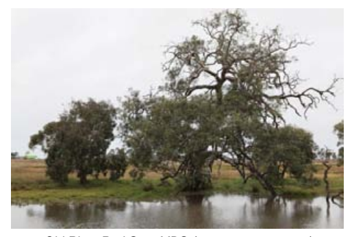
Old River Red Gum MBG

http://www.flickr.com/photos/keepaustraliabeautifulvictoria/sets