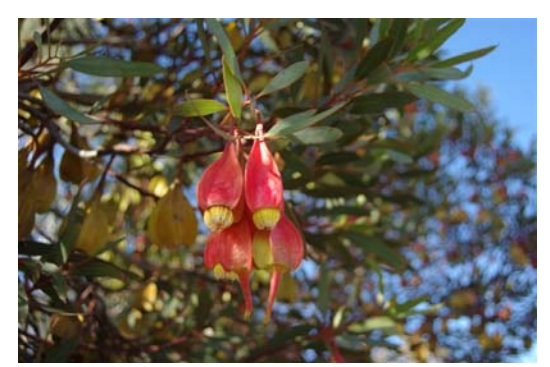
Fuschia Gum (E.forrestiana) Melton Botanic Garden

Categories include: Wildlife and plants, botanic garden scenes, flowers, close-up of plants, people and botanic gardens, objects and plants and a general section for anything else.