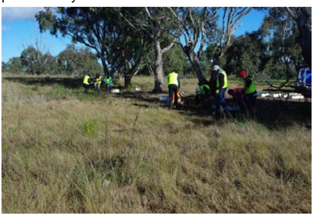
Conservation Volunteers Australia Planting

Margaret Peters has more details on all these plants if anyone would like them.