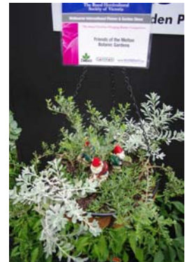
FMBG display and hanging basket

We received many questions about the Melton Botanic Garden and people also saw the FMBG hanging basket in the RHSV Hanging Basket Competition. Well done RHSV on getting 222 hanging baskets and making a world record (yet to be confirmed). The FMBG hanging basket contained three types of eremophias, which flowered well before the show, but did not produce a flower during the show. Of course it is now flowering again. We put in three gnomes to give some added interest to the basket. Feedback from the people looking after the hanging display section said the kids liked the gnomes. Many thanks to Barb and David Pye of Suntuff Natives who are also FMBG members for donating the plants for the basket.