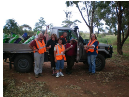
Friends with a ute load of bagged up weeds

We held two grow the garden days in March. FMBG volunteers hand weeded resulting in weeds being removed by the bagful from Ryans Creek and surrounds. Well done everyone.