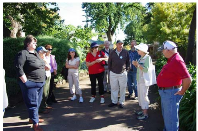
FMBG members with Friends of Ballarat BG hosts

After an update on things happening in the Botanic Garden a leisurely walk around to look at the various beds and heritage listed trees was made in pleasant sunny weather. Generally the gardens were in better condition than at our last visit in October 2008.