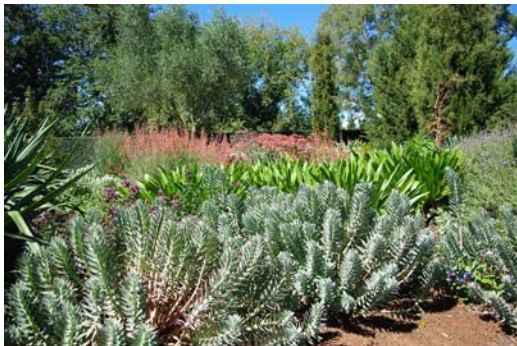
Dry garden at Lambley Nursery

An interesting feature was that the majority of propagation at Lambley is from cuttings taken from a large stock of "mother" plants growing in a very open area exposed to full sunlight. This area was a colourful spectacle of various flowers and leaf forms.