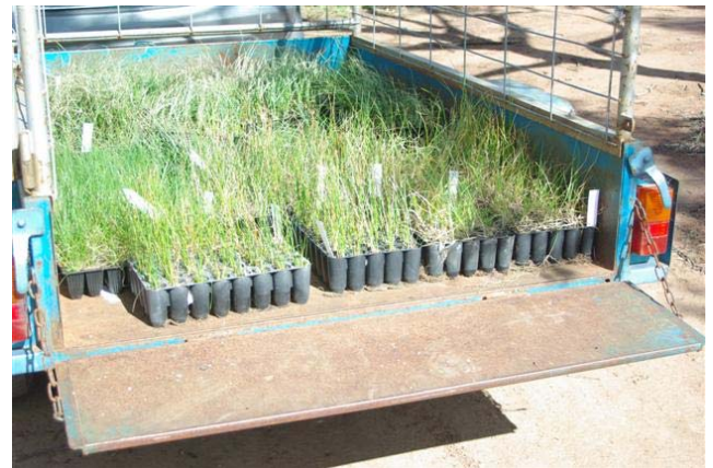
Vision for Werribee Plains Plants

Janet looked after everyone and supplied much needed refreshments.