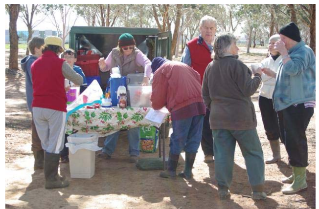
A well earned cuppa after planting

Why not join us at the next Grow the Garden Days – 10am-noon 2 nd Thursday and 4 th Sunday every month. We can assure you the Grow the Day is very therapeutic, great exercise and extremely enjoyable.