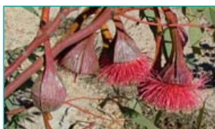
Eucalyptus pyriformis Dowerin Rose Western Australia Mallee to 5m tall