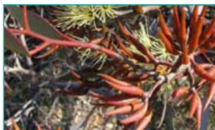
Eucalyptus eremophila Sand Mallee Western Australia Mallee to 5m tall