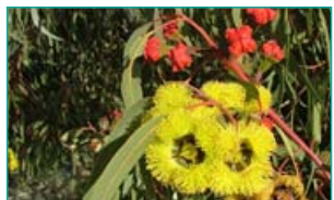
Eucalyptus erythrocorys Illyarrie Western Australia Tree to 8m tall