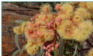
Eucalyptus "Torwood" Hybrid Gum Western Australia Tree to 6m tall