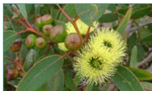
Eucalyptus preissiana Bell-fruited mallee Western Australia Mallee or spreading shrub to 2.5m tall