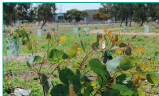
Seedlings propagated by FMBG and APS