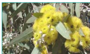
Eucalyptus woodwardii Lemon-flowered gum Western Australia Mallee to 10m tall