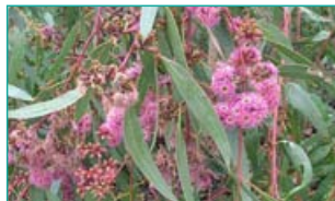
Eucalyptus albopurpurea Coffin Bay Mallee South Australia Mallee to 5m tall