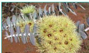
Eucalyptus kruseana Bookleaf mallee Western Australia Mallee or shrub to 3m tall